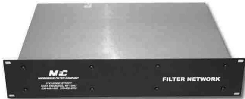
R17700 Rack Mount

Deletes an entire QAM channel for the purpose of reinserting alternate programming (e.g. – Instructional, Security Camera, etc.).