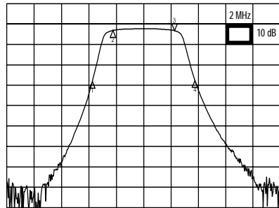
Typical Frequency Response of 3303