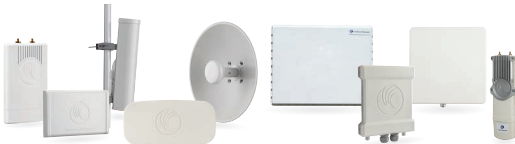
(L to R) ePMP 2000 AP, Smart and sector antenna, Force 180, Force 200

Our wireless access solutions enable your organization to deploy and extend high-speed communications more quickly and much more cost-effectively than fiber or wired solutions. Cambium technology significantly reduces the cost of deployment and speed the time to market, allowing for installation in a matter of days or weeks, as opposed to months or years. The platform's exceptionally low acquisition, installation, operation, and maintenance costs result in substantially lower total cost of ownership, as well as delivery of ROI in months.