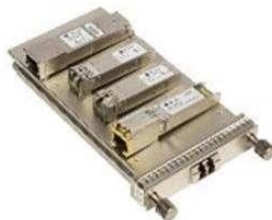
GBIC, Xenpak, X2, XFP,SFP, SFP-, QSFP-, CFP, CFP2, CFP4, 1G, 10G, 25G, 40G, 100G

Reduced Capex & reallocate resources for more critical needs!