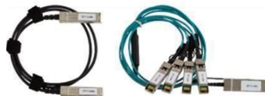
OEM Compatible DACs/AOCs Direct Attach Cables coding each end independently

Data Center, Route & Switch, FTTx, GPON (OLT & ONU), Active E, CWDM/DWDM, Short to Extended Reach Transport, Tunable, Multi-code