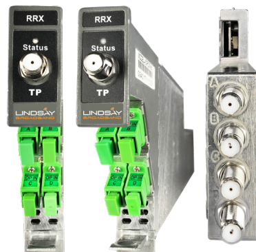
LB-1000-RR Module (front and rear views)