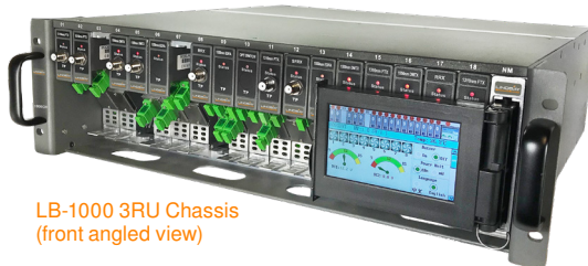
LB-1000 3RU Chassis (front angled view)

The LB-1000-RR series is a family of CATV return path receiver modules, converting upstream optical signals into RF signals at the headend or remote hubs. The LB-1000-RR return receiver incorporates a low noise PIN detector and RF amplifier chain. Internal selectable RF attenuators can be switched in or out to enable each receiver to handle a very wide range of optical input signals. Module parameters can be monitored and configured through the LB-1000-CM system management control module using the touch screen or by using a PC (web GUI or SNMP agent).